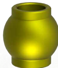
Top link ball