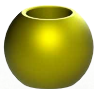
Lower link arm ball