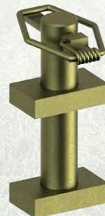
Lift rod pin and plate